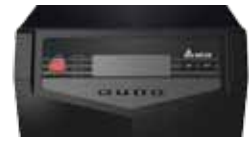
Control and LCD Display Panel

* When input voltage is 242 ~ 324/140 ~ 187 Vac, the sustainable loading is from 70% to 100% of the UPS capacity. All specifications are subject to change without prior notice.