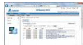
Advanced UPS Management Software - UPSentry 2012